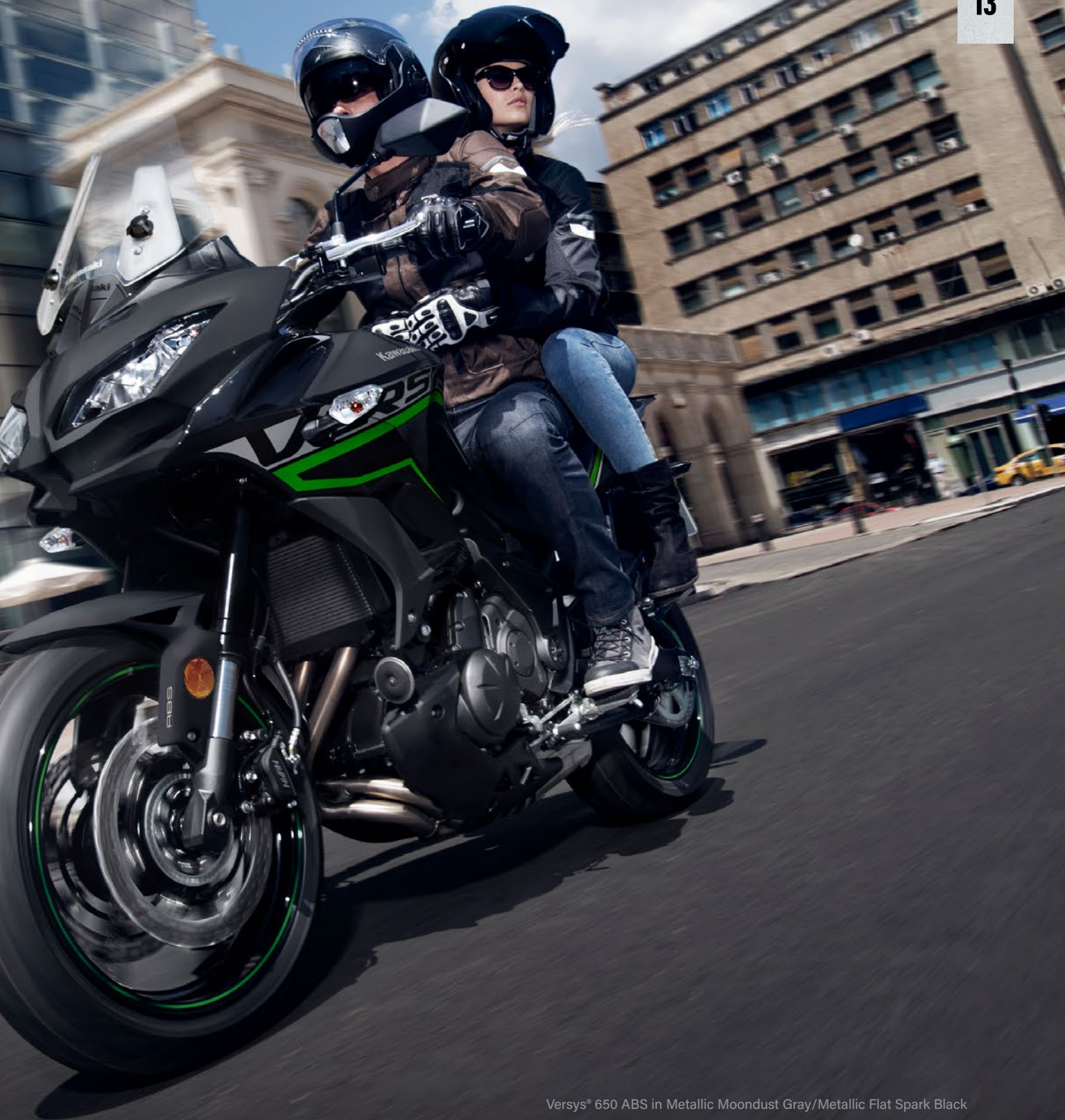
Versys® 650 ABS in Metallic Moondust Gray/Metallic Flat Spark Black