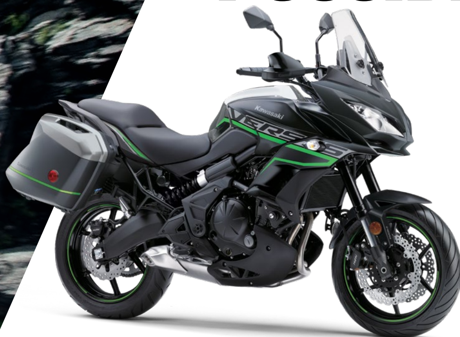
■ Metallic Moondust Gray/Metallic Flat Spark Black