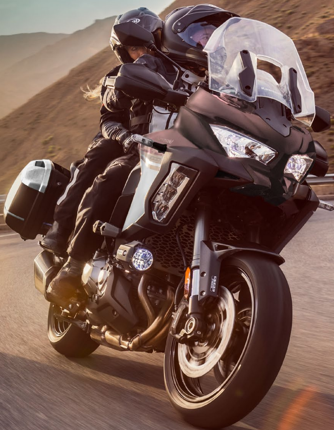
Versys® 1000 SE LT+ in Metallic Flat Spark Black/Pearl Flat Stardust White