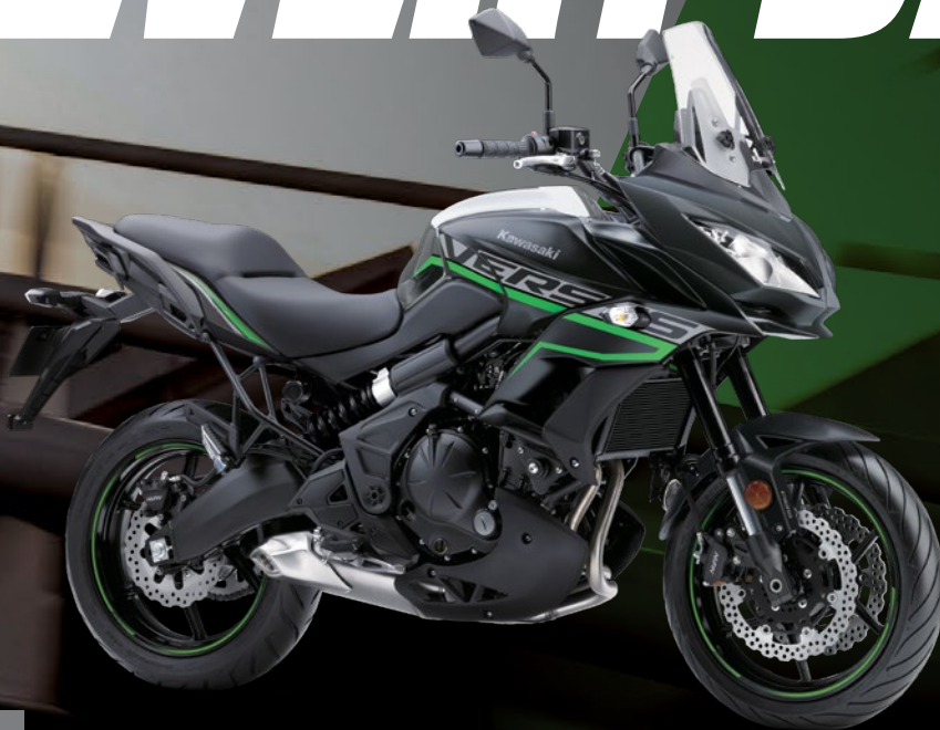
■ Metallic Moondust Gray/Metallic Flat Spark Black

With agility and all-day comfort, few can match the Versys® 650 ABS motorcycle when it comes to performance, versatility and sheer fun. Answer the call of the open road with the nimble yet powerful 649cc parallel twin-powered Versys 650 ABS. The upright riding position, exceptional long-range potential and sporty chassis are the recipe for a fun open-road adventure on the interstate or through backroads. From your urban commute to your weekend adventure, the Versys 650 ABS is ready to pursue your destination.