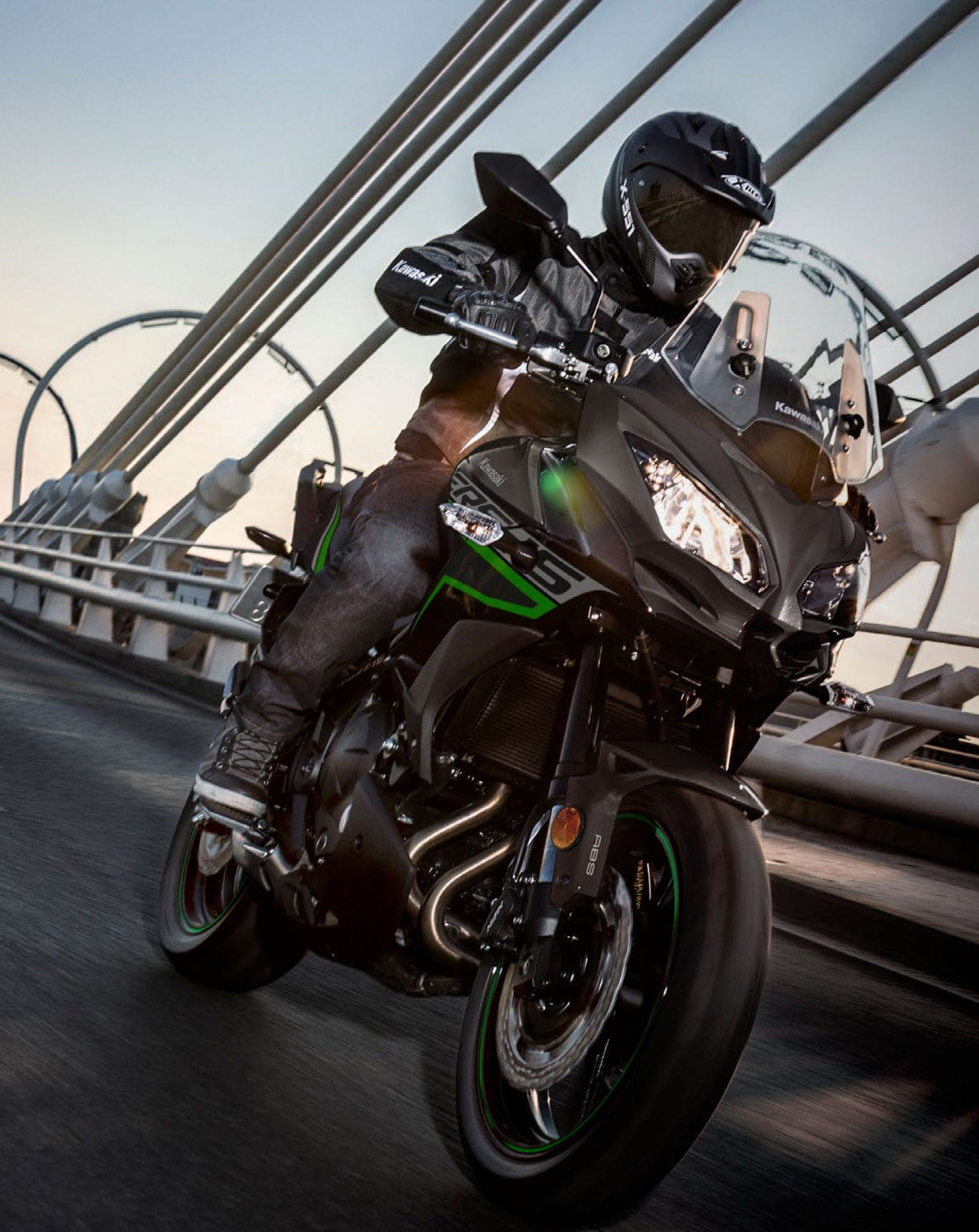
Versys® 650 ABS in Metallic Moondust Gray/Metallic Flat Spark Black